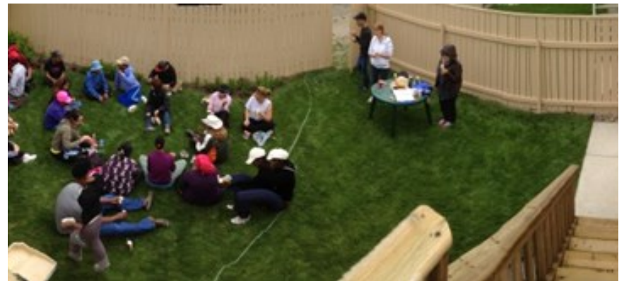
Volunteers make a visible difference through Project Paintbrush

Volunteer Lethbridge builds connections and empowers individuals and organizations to enhance volunteerism and grow volunteer capacity.